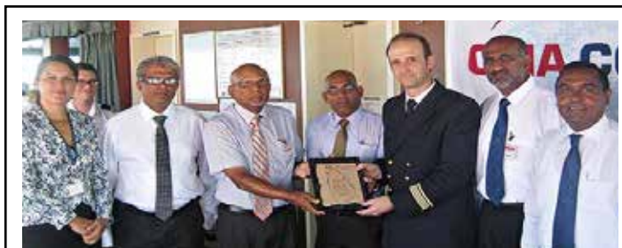
International Container Terminals (CICT) recently welcomed the maiden call of CMA CGM Nabucco, the first vessel under the Ocean Alliance to call on the Port of Colombo. The vessel operated by CMA CGM was the first in a new weekly service attracted to Colombo by CICT this year, and will operate under the USEC 3 Columbus Suez service of the Ocean Alliance.

Colombo International Container Terminal, handled 2 million teus of the total in 2016, with a 28 per cent growth YoY, while the other privately-owned terminal, the South Asia Gateway Terminal, handled 1.63 million teus, growing 19.03 per cent YoY. ●